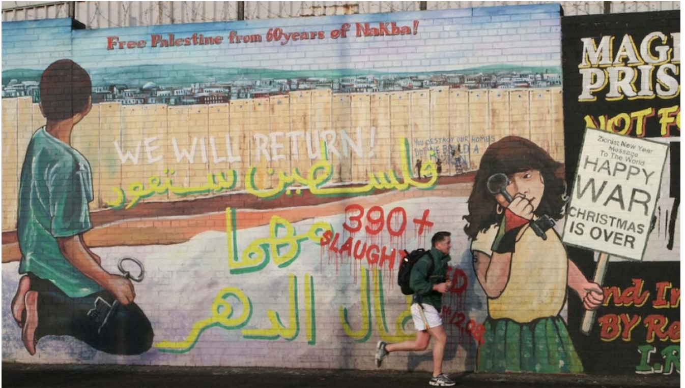
Painting image on Fall's Road, Belfast (Ireland)