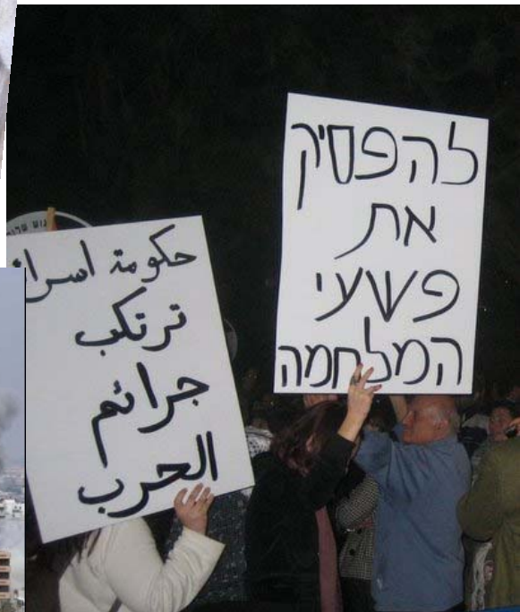
Arabic and hebrew : Stop War Crimes